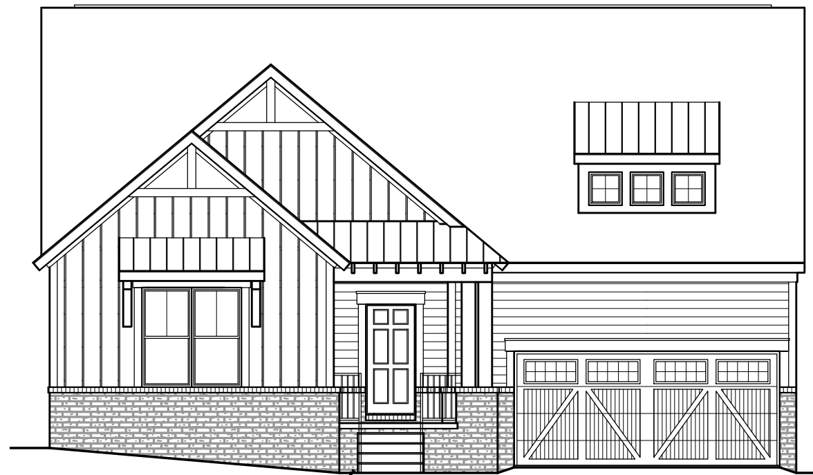
Front Elevation Parcel 'B'